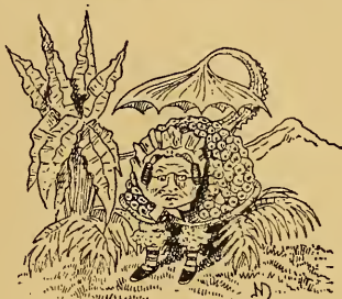
THE FEMALE PECCADILLO.

We thanked her for her kind promise, and proceeded over the grass to the other side of the huge rock I had christened Memorial. Here we found a